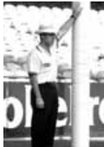
• Ball touched goal post (tap post three times) followed by behind signal.