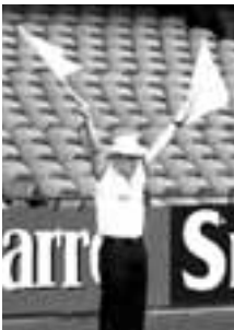
• Goal: from starting position flags will be brought across once, back once and down to sides.