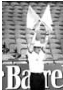
• Score has been annulled.