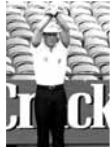
• Blood rule.