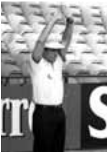
• Ball is touched before crossing goal line followed by behind signal.