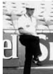
• Ball has come off the leg above the knee.