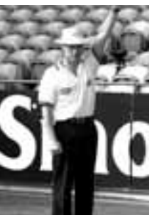
• Out of bounds – signal to boundary umpire.