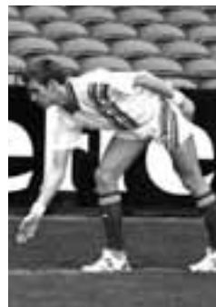
• Indicating where the ball crossed the boundary line on the full.