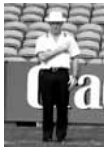
• Behind has been scored – signal to boundary umpire.