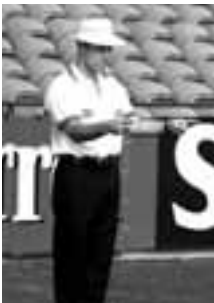
• Goal: untouched.