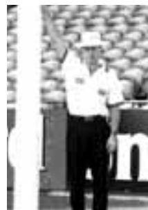
• Ball strikes behind post on full, hit post three times. Then signal out on the full.