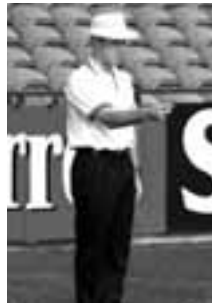
• Behind: untouched.