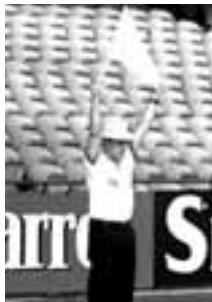
• Behind: from starting position flag brought across, back and down.